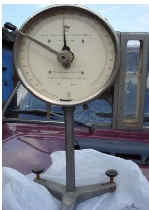
Figure 2. Torsion balance