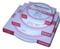
Figure 3. Ashless filters

Other equipment and reagents are on the books of the laboratory of National Academy of Agricultural Sciences of Ukraine, National Scientific Centre “Institute of Agriculture, NAAS”.