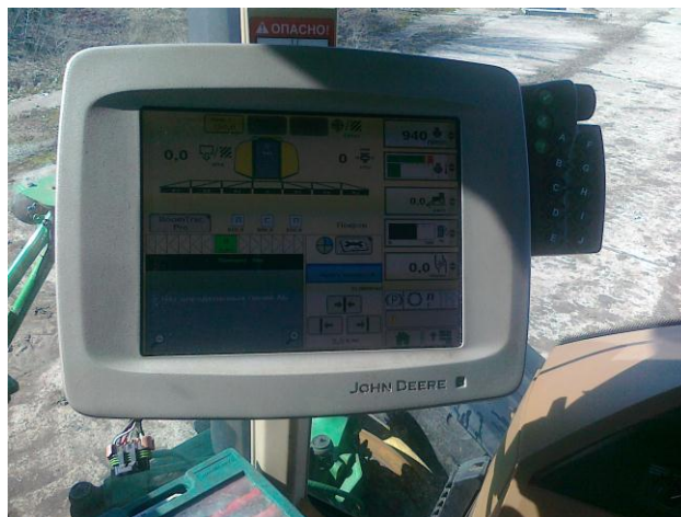
Figure 5. GreenStar2 display