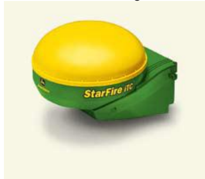
Figure 4. StarFire iTC receiver