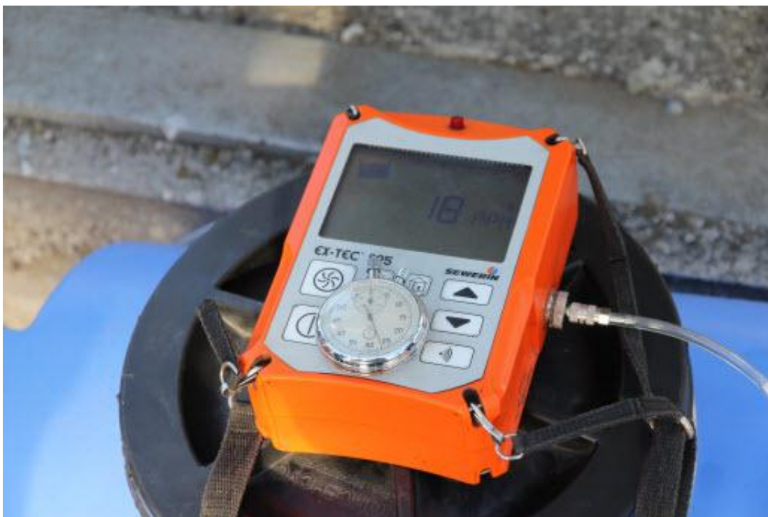
Figure 2. Photo to the gas analyzer EX-TEC® SR5 and stopwatch SOSpr-2b-2

Gas analyzer has explosion protection (CENELEC).