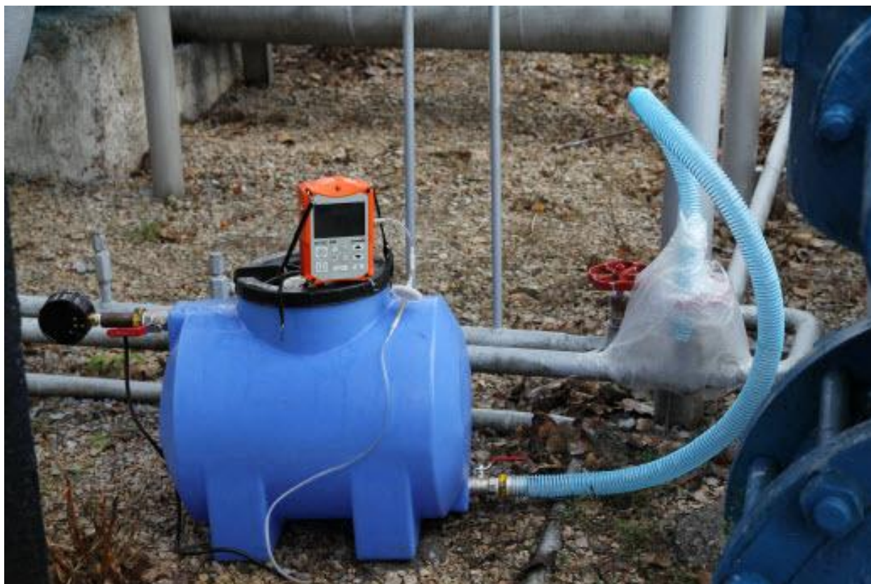
Figure 1. Photo of installation for quantitative measurement of methane leaks

To solve these problems a special setting was made on the base of plastic capacity of the known volume (0,11 m 3 ), a package, plastic hose and manometer (refer to Figure 1). All connections are hermetical.