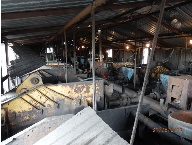
Fig.3 Project equipment

Source for receiving low ash coal concentrate is waste coal at the operational site SLAVUTICH MChTPP.