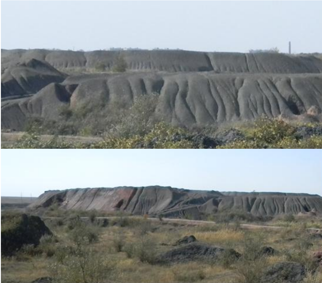
Fig.4 Waste heaps

Most of the equipment utilized by the project such as trucks, excavators, bulldozers is of a standard type used for industrial applications worldwide. The project activity will use a limited number of individually ordered equipment.