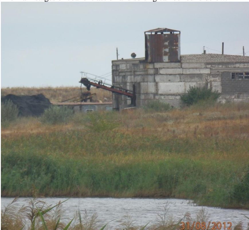
Fig.2 Processing Complex.

The main stages of coal extraction and sorting can be found below.