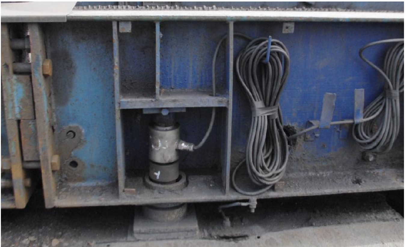
Figure 2 Automobile scales