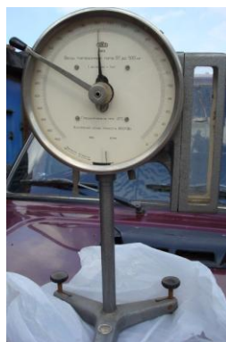
Fig. 2 Torsional Weighing Machine Produced in Poland. Measurement error does not exceed 1 mg.