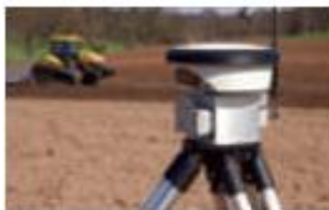
Fig. 6 Mobile RTK base