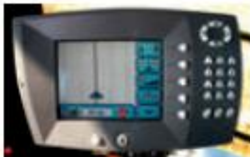
Fig. 5 Display of “Auto-Guide Challenger” system