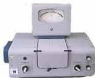
Fig. 1 Photoelectric Colorimeter

Photoelectric colorimeter type KFK-2, allowed value limit of fundamental absolute error of colorimeter while measuring the transmission coefficient \Delta = \pm 1 \%T . Spectral range from 315 to 980 nm.