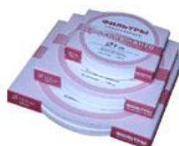
Fig. 3 Ashless filters

Other equipment and the necessary chemical reagents are on the balance sheet of National Research Centre "Farming Institute of the National Academy of Agrarian Sciences of Ukraine".