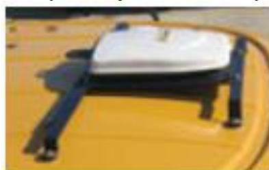
Fig. 4 GPS receiver