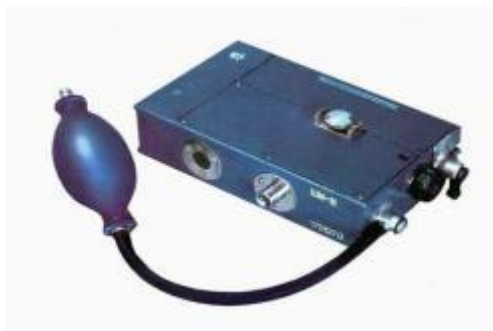
Figure 3. ShI-10 (ShI-11) mine interferometer

Specifications of ShI-10 (ShI-11) mine interferometer are provided in Table 3.