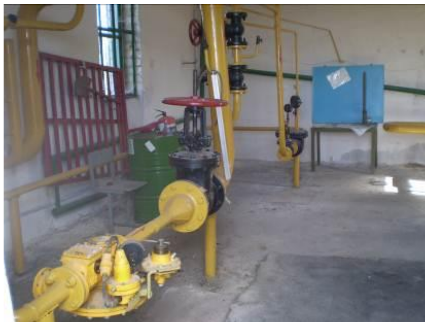
Figure 1. A repaired CGDP, Kharkiv

Samples of repaired (replaced) GDP (CGDP) equipment are provided on Figure 1.