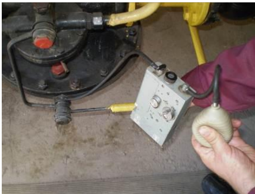
Figure 2. A photo of metering works being conducted, Kharkiv

To solve these problems, individual gas analysers – ShI-10 (ShI-11) mine interferometers (for specifications see Table 3) - were purchased.