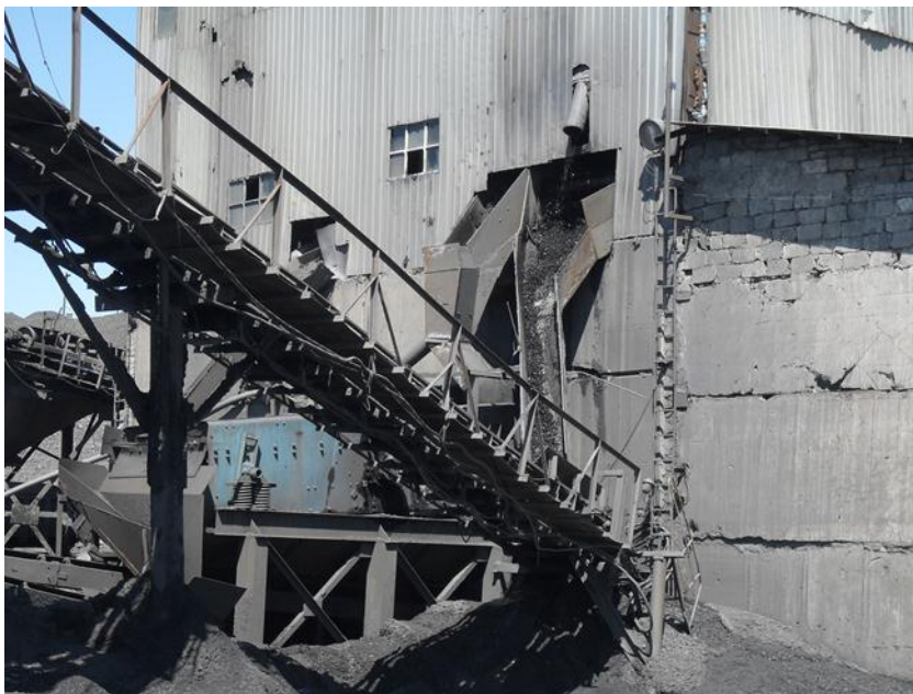
Fig.2 Project activity equipment

Dense medium cyclones are used for very accurate separation of particles of different density. Particles that are smaller than 0.5 mm are removed from the mixture before it enters the cyclone. Magnetite is added to the water/particle mixture to allow precise control of density. The dense medium cyclone is mounted at a certain angle. The lighter particles (coal) come out the upper end and the heavier particles (shale) the lower.