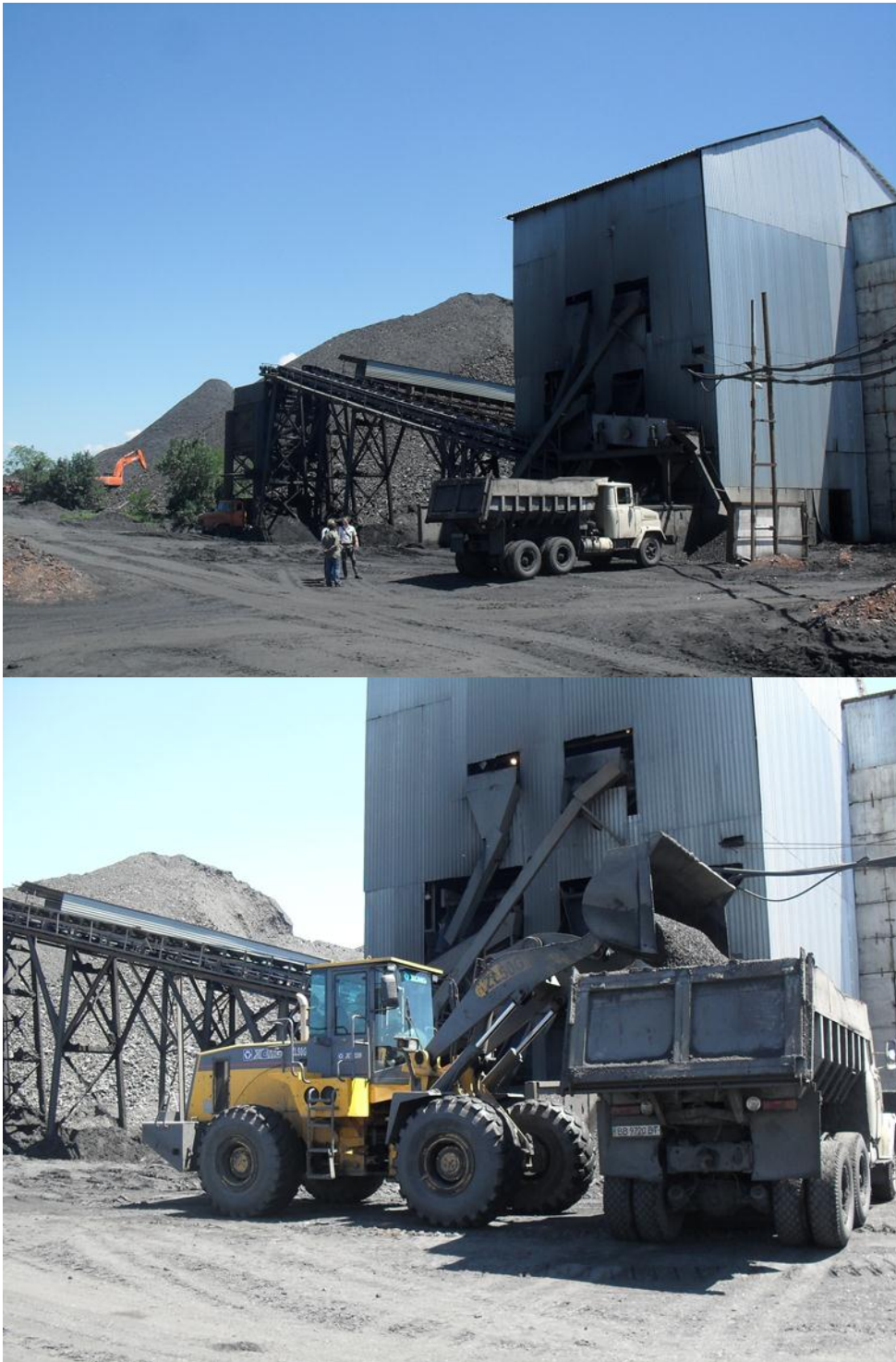
Fig.2 Project activity equipment

Dense medium cyclones are used for very accurate separation of particles of different density. Particles that are smaller than 0.5 mm are removed from the mixture before it enters the cyclone. Magnetite is added to the water/particle mixture to allow precise control of density. The dense medium cyclone is mounted at a certain angle. The lighter particles (coal) come out the upper end and the heavier particles (shale) the lower.