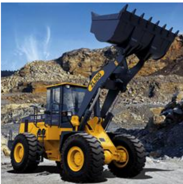
Fig.5 Truck XCMG model ZL50G