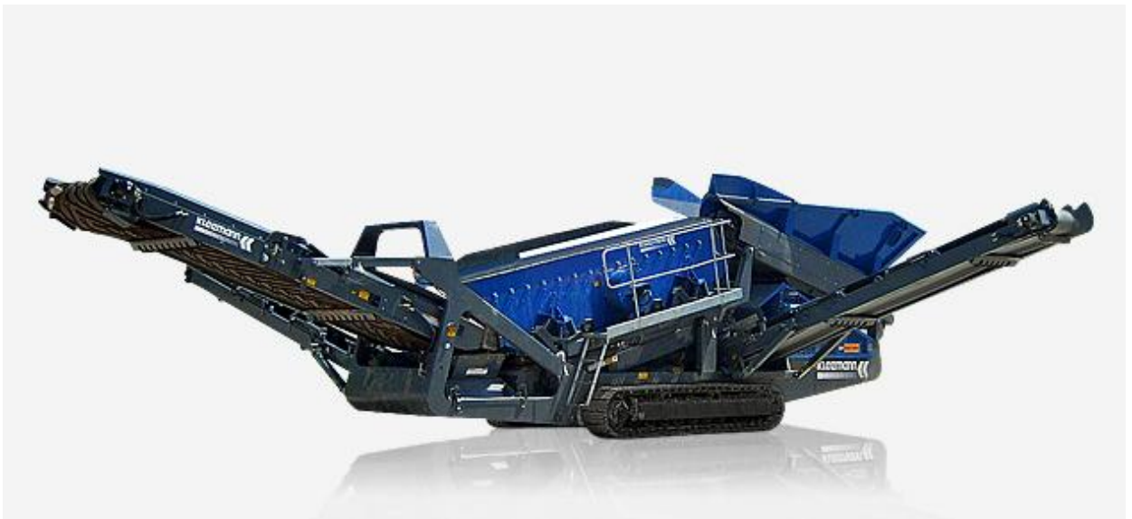
Fig.4 Mobile screen KLEEMANN 15 Z-AD