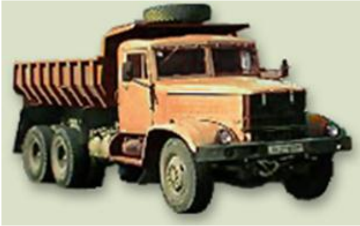
Fig.3 KRAZ 256