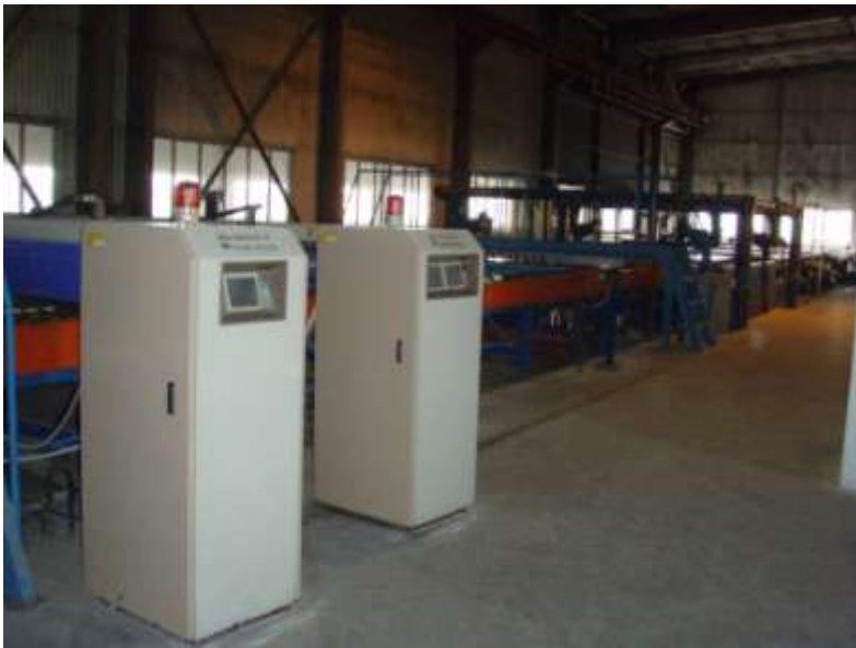
Fig. 3. Equipment of glass quality control