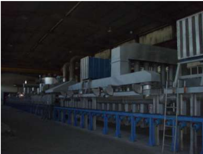
Fig. 4. Tin bath