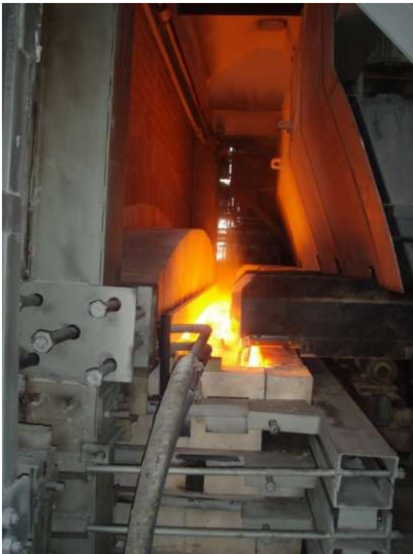
Fig. 6. Batch feeder assembly at the furnace in workshop № 3.

The schedule of the abovementioned measures is given in Table 1.