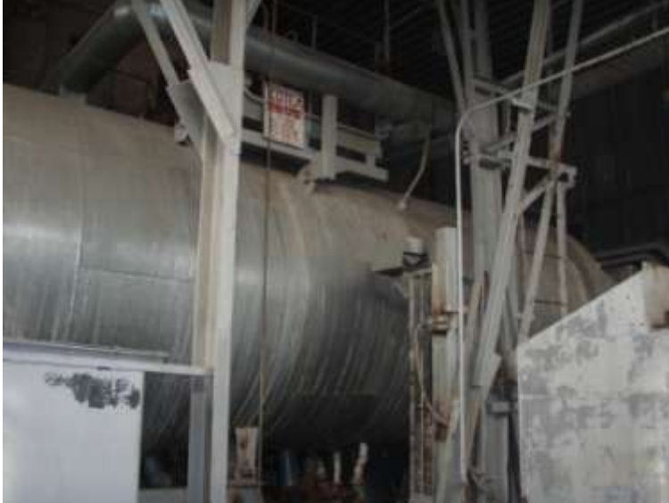
Figure 1. HRSG

Installation of HRSG after glass-melting furnace of workshop #2-2 took place in 2008.