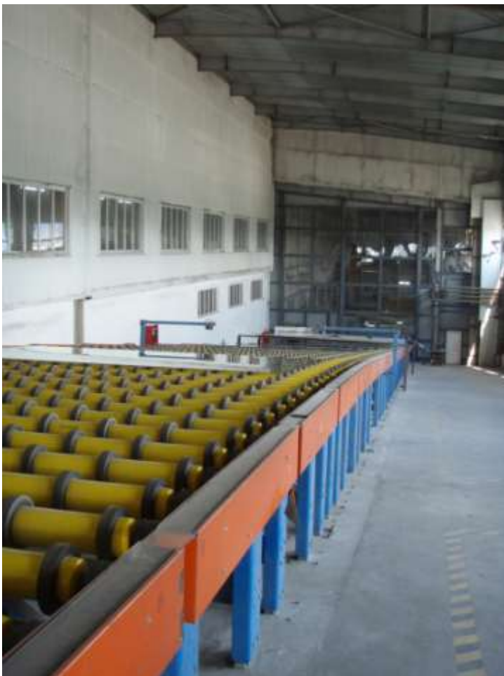
Fig. 2. Conveyer of glass sheet.