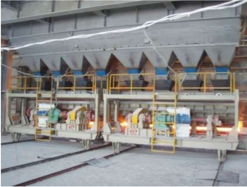
Fig. 5. Glass furnace.