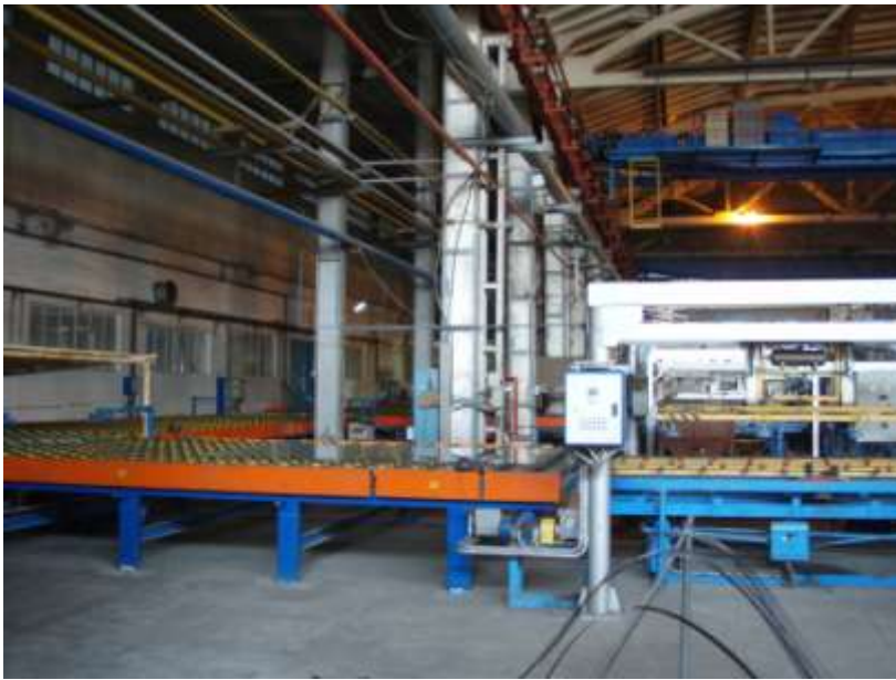
Fig. 1. Workshope 2-2 equipment