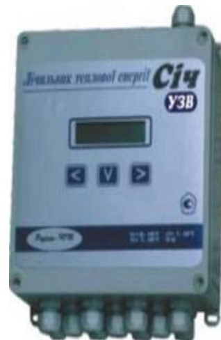
Figure 4. Heat and water meter (CIY-Y36)