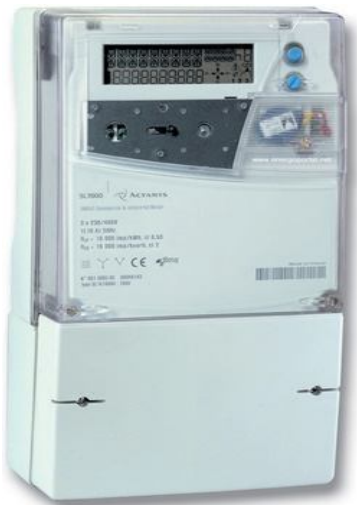
Figure 1. Electric meter SL7000