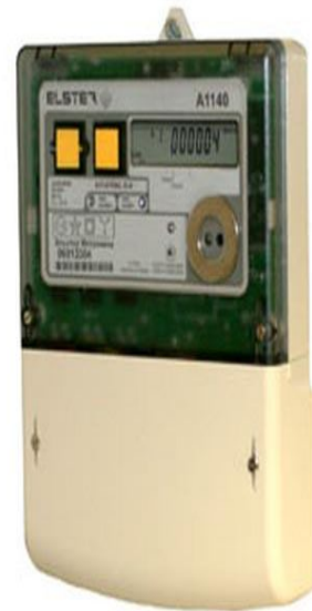
Figure 2. Electric meter A1140RAL-BW-4T