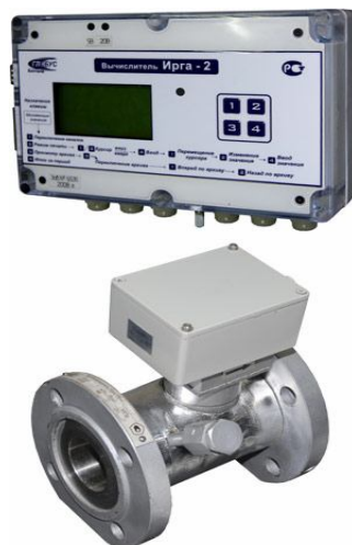
Figure 5. Water meter (IPKA)