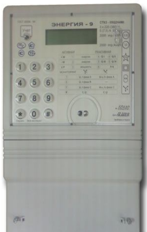
Figure 3. Electric meter CTK3-10Q2H6Mt