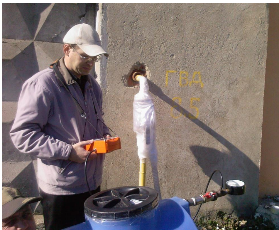
Picture. 1. Photo of a plant for quantitative measurement of methane leakage (monitoring measurement of leakage on ball-valve, diameter 50 mm, list number 00-2862, Baltskaya road).

A special plant was made to solve these problems. It is made on the basis of a plastic capacity of a certain volume (0,87 m 3 ), package, plastic hose and pressure gauge (see Picture 1). All junctions are sealed.