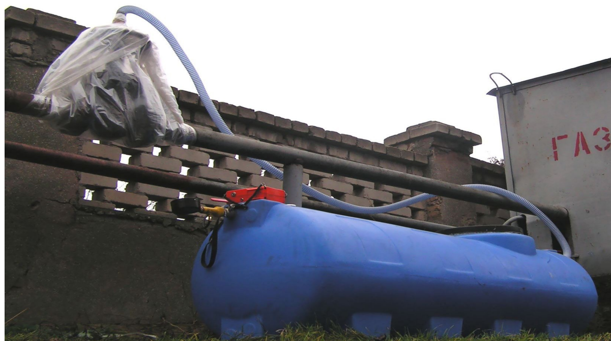
Picture. 1. Photo of a plant for quantitative measurement of methane leakage.

A special plant was made to solve these problems. It is made on the basis of a plastic capacity of a certain volume (0,87 m 3 ), package, plastic hose and pressure gauge (see Picture 1). All junctions are sealed.